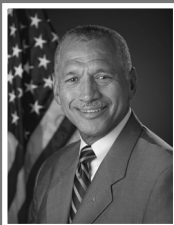
MGEN Charles F. Bolden Administrator of NASA